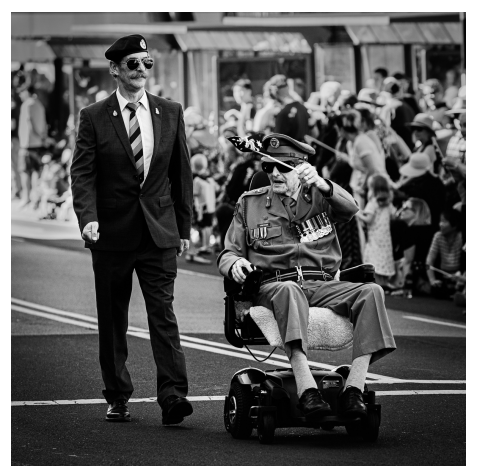
Veteran Veterans Marching