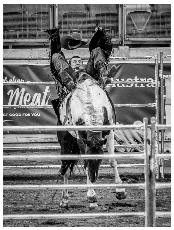
Ride em cowboy