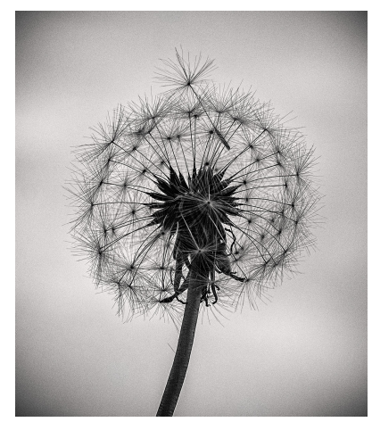
Ready for Take Off