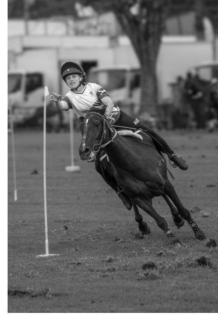
Eyes on the Flag