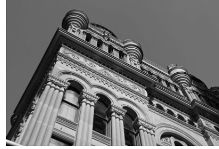
Great Architecture Accepted Lynley Olsson