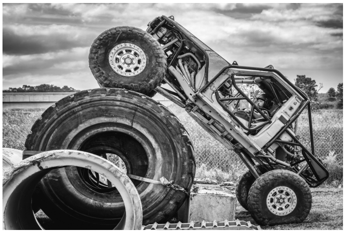
Boys And Their Toys