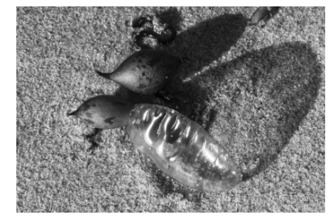
Beach Flotsam Accepted Ross Bembrick