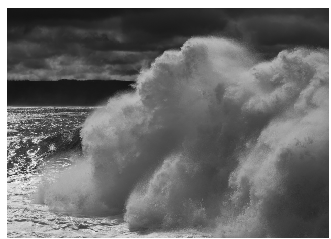
The Big Wave